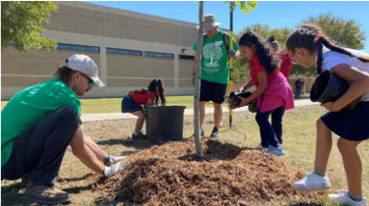
ACE employees gather to plant trees and support local students and cultivate a beautiful, healthy environment.